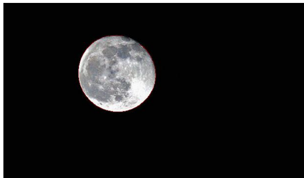
Fig. 3: Moon crescents circles