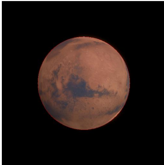
Fig. 1: Mars Circles